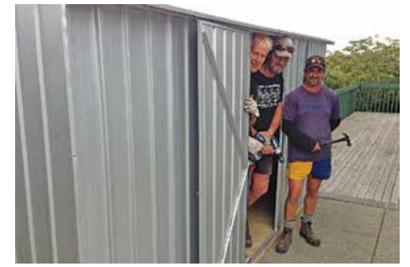
Volunteers erect a new storage shed alongside our South Canterbury Centre

In contrast to my last three annual reviews, it is with much pleasure that I can report that the Cancer Society has experienced a largely 'uneventful year'. 'Uneventful', in the sense that we have been