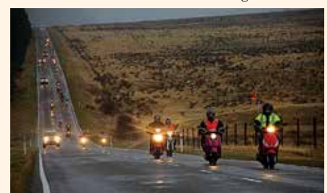
Tranz Alpine Scooter Safari