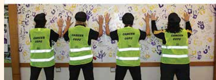
Ashburton staff prepare for mayhem at Relay For Life