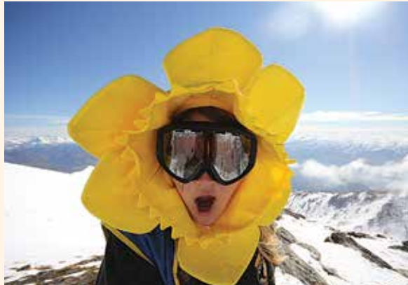
Ice Challenge promotion