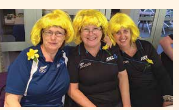
Funds raised at the ANZ quiz night in Ashburton were donated to the Cancer Society