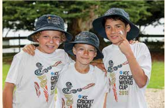
ICC Cricket World Cup fans