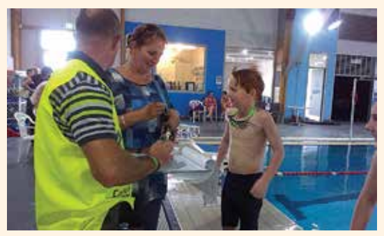
Pupils held a 'Swim the Strait' fundraiser challenge in Greymouth