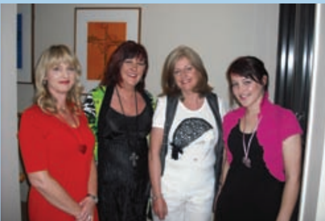
Models dressed in clothes by Bliss