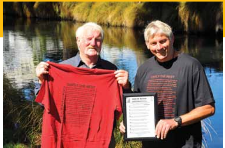
Two well known Canterbury rugby sons—Alex Wylie and Todd Blackadder with the Simply the Best T-shirts.

The framed poems are $50.00 and the T-shirts, which are available in children's sizes through to XXL, are $35.00 plus postage and packaging. The Cancer Society receives a generous donation from the sale of each item.