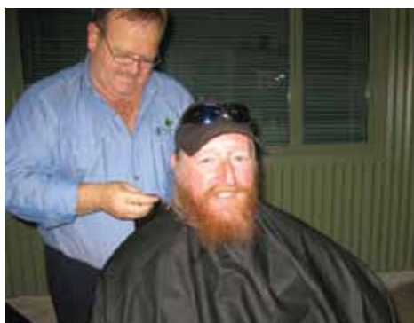
An 18-year-old beard getting ready to be shaved!

On the West Coast, Pike River Coal was right behind the event with Cancer Society staff being actively involved in their "shave off". In other parts of the division, Cancer Society volunteers assisted Bunnings staff in distributing men's health information.