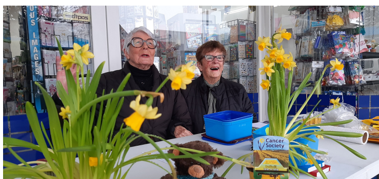
Daffodil Day in Dannevirke