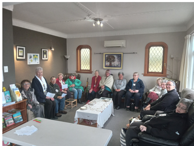
Levin Women's Support Group