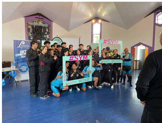
Smear Your Mea 2023