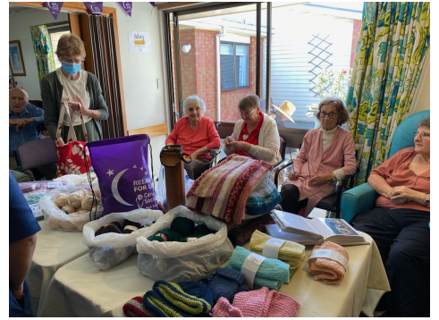
Cook Street Nursing Care Centre Knitting Relay!

We are also grateful for our supporters who remember the Cancer Society in their wills. This year we received over $370K in bequest income, which we use to provide services to cancer patients and their family. It also helps the Centre to build up some reserves which we may need given the likely economic headwinds the community is facing.